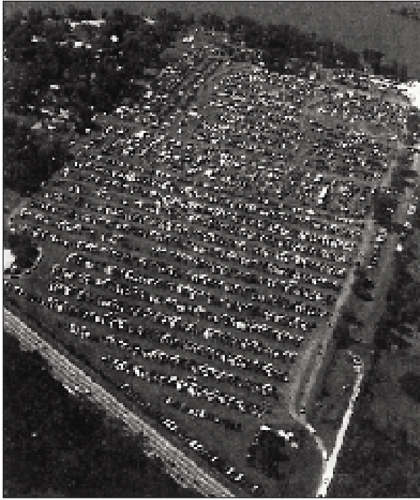
AERIAL VIEW OF AUTORAMA